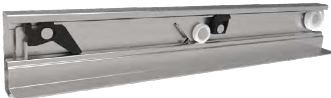
ST8201 For Bottom-Mount Drawers