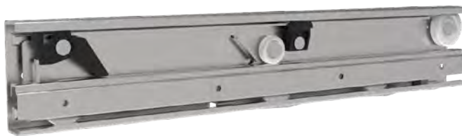
ST8200 For Side-Mount Drawers